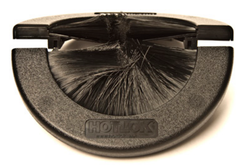
Round 4" Rack Mount Grommet - Part No. 40002