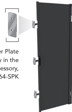
Striker Plate sold separately in the Striker Plate Kit Accessory, part number 10164-SPK