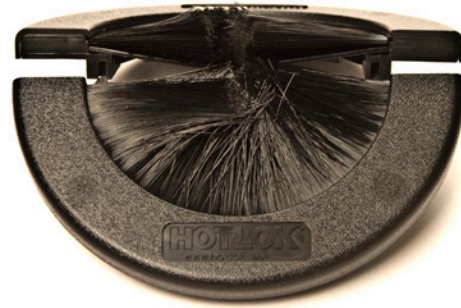
Round 4" Rack Mount Grommet - Part No. 40002